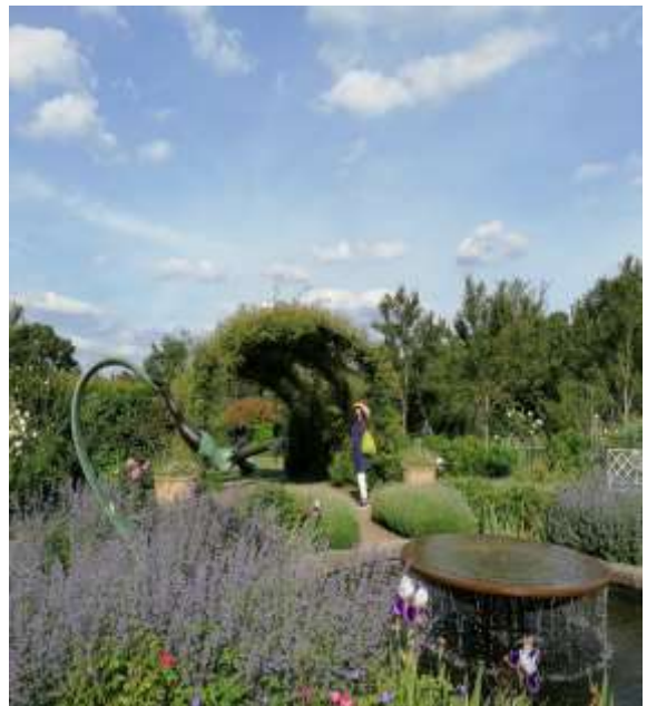
The Cottage Garden at RHS Wisley